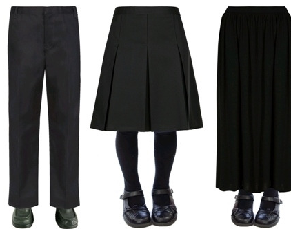
These are all appropriate options for ladies.